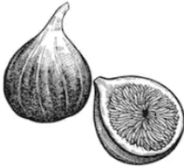
Fig. 1: An example of figure.