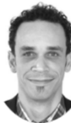
David Folio Use IEEEbiography with figure as option and the author name as the argument followed by the biography text.

John Doe Use IEEEbiographynophoto and the author name as the argument followed by the biography text.